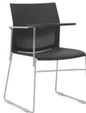
KON-PRETA-UNIV FIXA KON-COLORIDA-UNIV FIXA