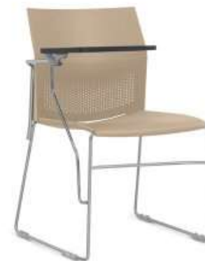
KON-PRETA-UNIV BASC KON-COLORIDA-UNIV BASC