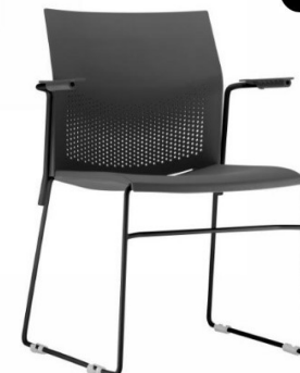
KON-PRETA-COM BRAÇO KON-COLORIDA-COM BRAÇO